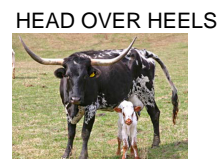
HEAD OVER HEELS